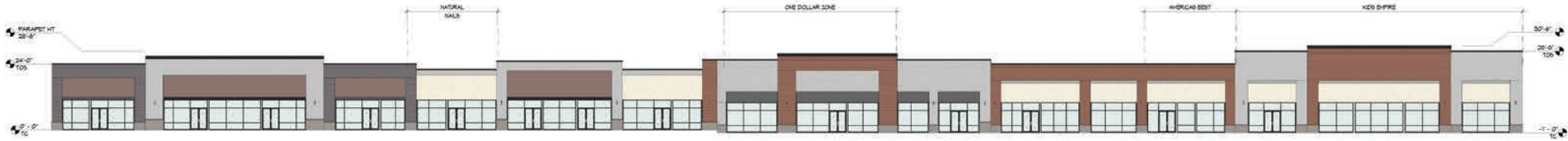
3 FRONT ELEVATION 1/8" = 1'-0"